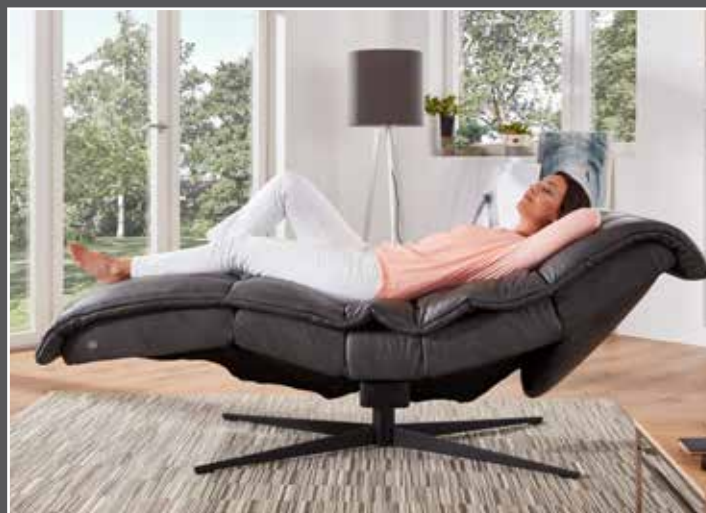
adjustment of leg rest, seat inclination and headrest to a horizontal sleeping position