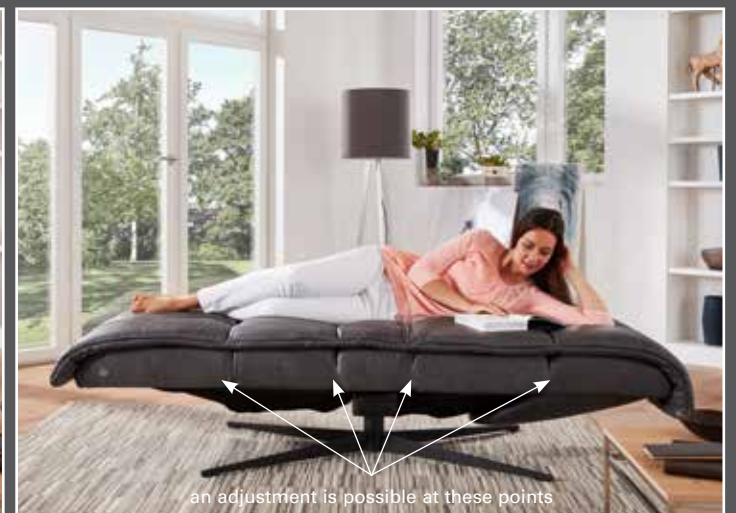
an adjustment is possible at these points