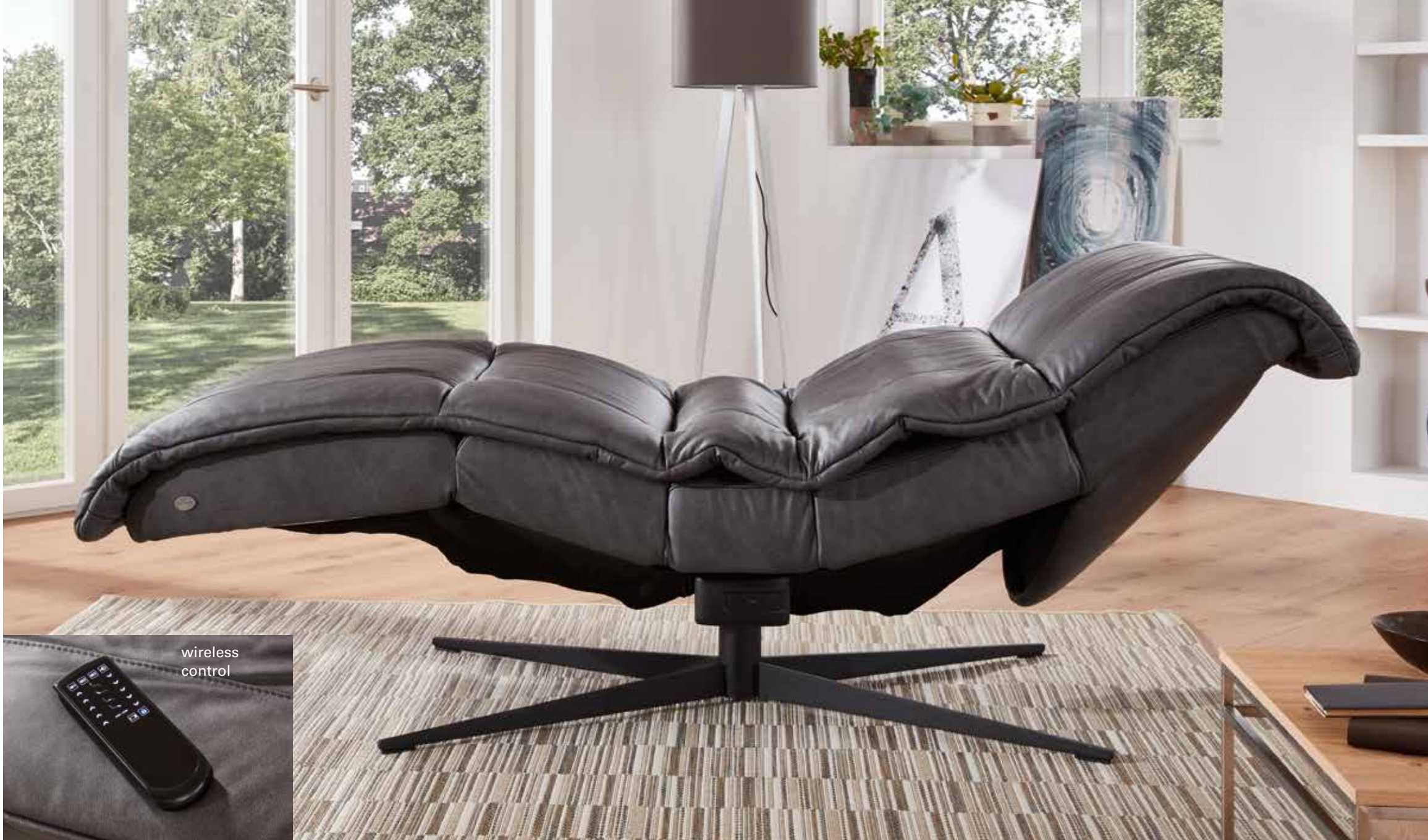
Composition: 30 R (base 63 anthracite)