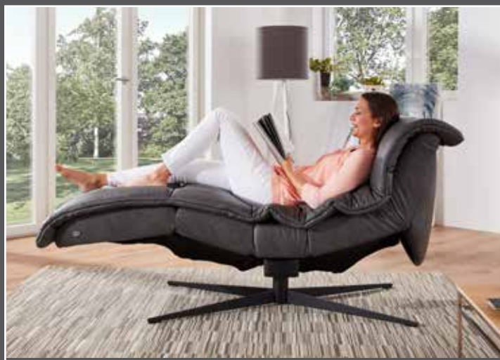
electric adjustment to a relaxed sitting position