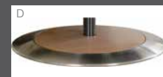
wood with stainless steel ring