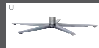
star base stainless steel look