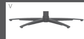
star base powder-coated anthracite

- all electrical variants can be delivered with external storage battery