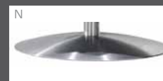
stainless steel look