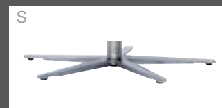
star base chromed