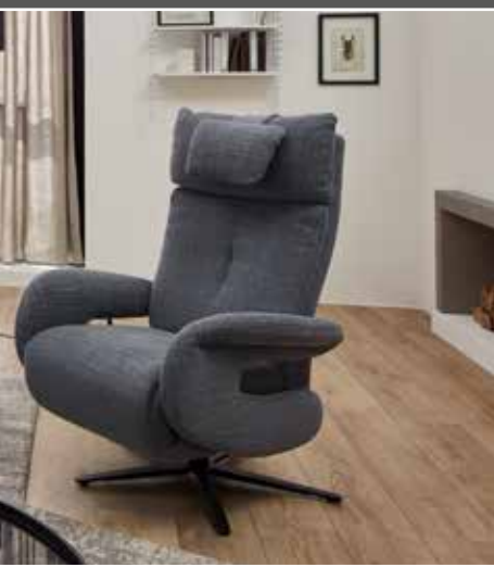
matching S-Lounger 7817