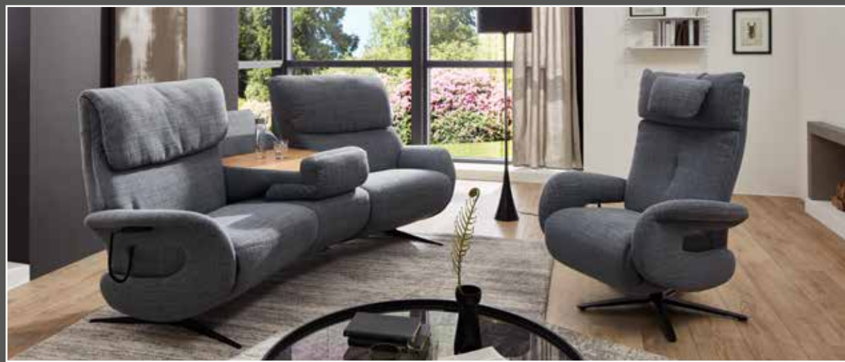
trapezoidal sofa 69Q in 20 Urbino blue