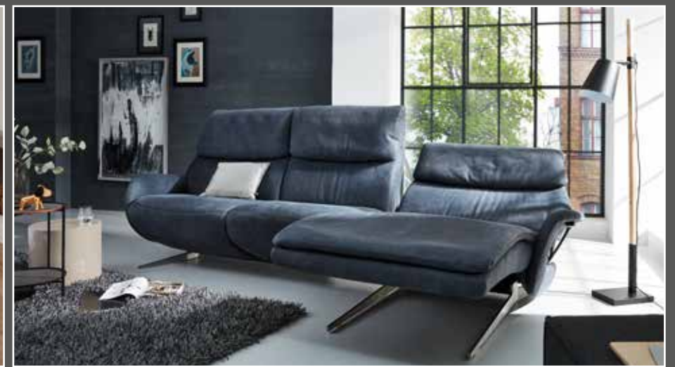
Variant 30 with adjustable backrest and lowering of seat